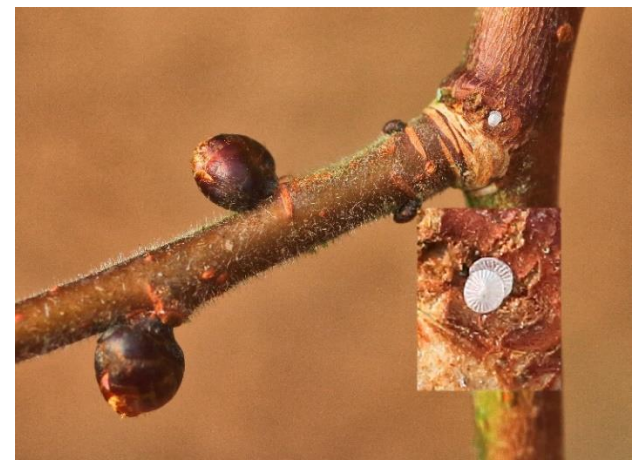
Dusky-lemon Sallow eggs + enlarged view (IC)