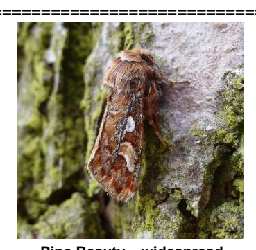
Pine Beauty – widespread across the Borders

Please write in with your articles and views. The next issue is planned for autumn 2018. Email to me at the above address or by post to: 12 Barefoots Crescent Eyemouth, Berwickshire TD14 5BA