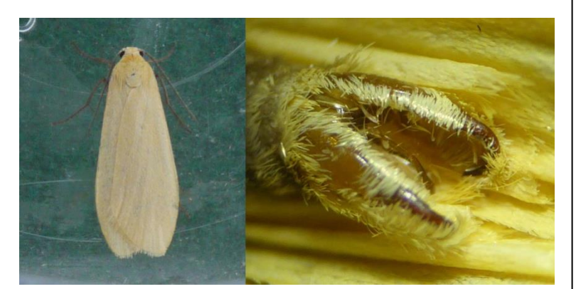
Orange Footman (AB) and characteristic male claspers (MC)

The next stage in positively identifying the moth was to preserve the specimen by freezing it to keep it in pristine condition. The insect was put in a pot inside a polythene bag and placed in the deep freeze. This might seem unacceptable to some but it is likely that the moth was not on its own as it seems recognised that it is a southern species moving north, particularly as there appeared to be one caught near the Northumberland-Durham border on 27th May 2017.