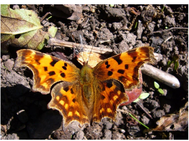
and one from 2017 (DS)

That night the most awful autumn storm passed over, thunder, lightning, torrential rain. Next day there wasn't a bird let alone an insect moving. Difficult to remember in these days of digital photography but an anxious wait ensued. Eventually the prints came back from the processor. It was a Comma.