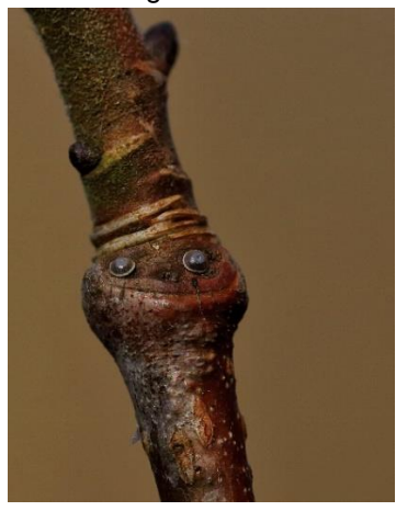
Two WLH eggs (IC)

After only a few weeks I became proficient at recognising Elm from a distance, but what's going on close up? The butterfly lays its eggs between the old and new growth spurs and looking at the tips of these branches is like looking into a whole new universe under magnification. The White-letter Hairstreak is not the only species of Lepidoptera to follow a similar strategy. Before now, I had no idea. I found several eggs after my first few searches that were, as far as I knew, moth eggs of some sort and was later to learn that I was finding eggs of the Brick moth and the Dusky-lemon Sallow. The Dusky-lemon Sallow was quite interesting as it has been very scarcely recorded in the Scottish Borders yet I found it at several locations. Perhaps this species is quite shy of the moth trap, or it too could be establishing itself in the area.