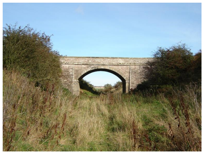
Disused line near Reston (BP)

Railway lines have, for many years, formed some of the most important arteries of Britain, linking our towns and cities and forever changing much of the landscape. Many of us will know of the Beeching Report of the 1960s which eventually led to huge reductions of track. These amounted to something like a 30% loss of mileage between 1961 and 1968 alone. It is difficult not to feel a tinge of sadness (or even fury!) at this destruction and yet, today, we have benefitted greatly in other ways. Mile after mile of wonderful green corridors stretch through the Scottish Borders with these areas often providing easy access to largely unspoilt and near-deserted magical wildlife havens.