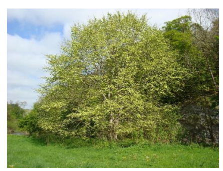
magnificent Elm at Edrington Mill in May 2008

So, starting from scratch, and identifying the Elm tree in winter. Now, that took time to achieve, but surprisingly I twigged fairly quickly. I was feeling very ignorant that I was quite unable to differentiate between Cherry, Elm, Lime or Sycamore. I found that the Elm most likely found in our area is the Wych Elm, and that it's a lot more widespread and common than I thought.