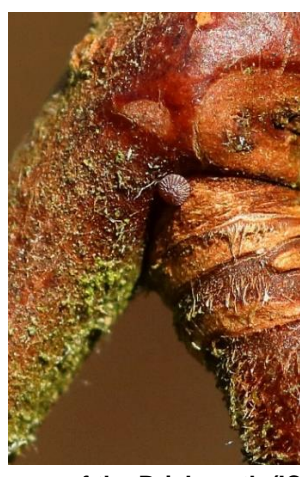
egg of the Brick moth (IC)