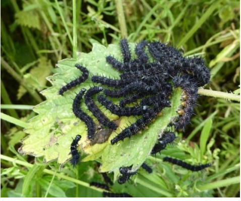
Vestal (BP) Peacock larvae on nettle (BP)

Larvae of the White-line Dart will feed on Common Mouse-ear ( Cerastium fontanum ) and wooded stretches of old railway will often include patches of the boldly-coloured Red Campion ( Silene dioica ). This is the sole foodplant of the Rivulet and is also used by Lychnis caterpillars. The ubiquitous Common Chickweed ( Stellaria media ) can host the Yellow Shell, Setaceous Hebrew Character and Angle Shades.