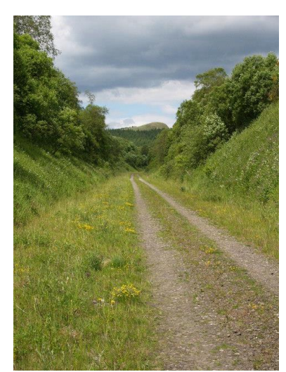
and near Whitrope (BP)

Available routes include the former lines which ran from: