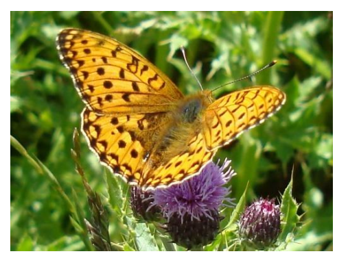
Beautiful Carpet (BP)